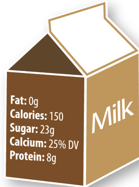
NONFAT CHOCOLATE MILK